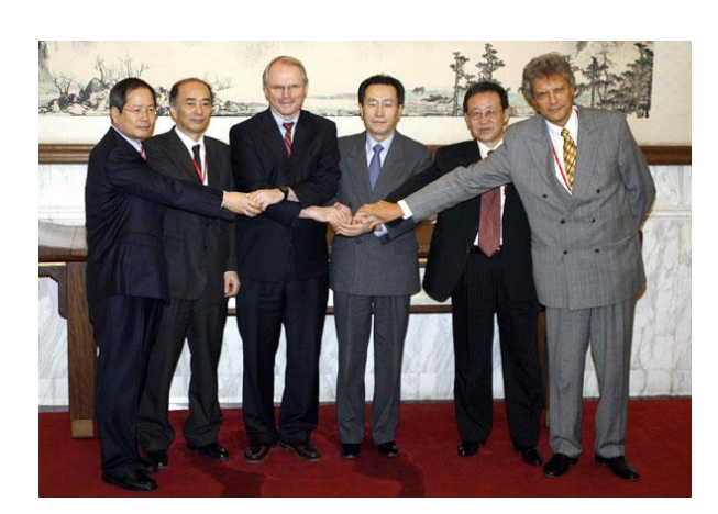
Figure 5: The delagations of the Six-Parties in December. 2006

On the other hand, there have also been multilateral agreements, for example through the Six-Party Talks, and the involvement of the UN. The Six-Party Talks are undoubtedly the most important platform for discussion on the nuclear programme of the DPRK. Not only does the DPRK open itself to dialogue with South Korea, Japan, China, Russia and the USA, but the Talks