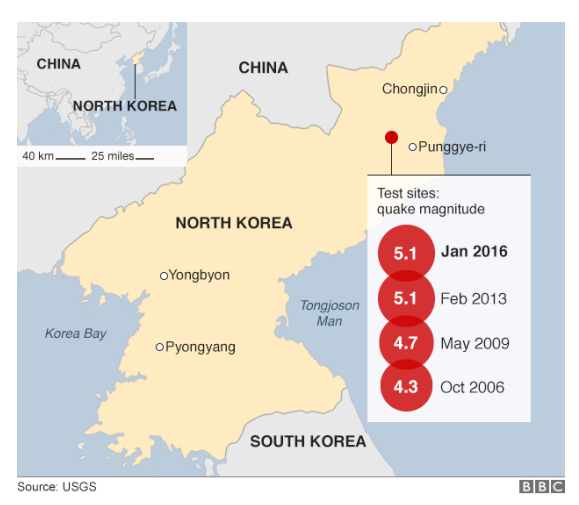
Figure 3: A map of previous North Korean nuclear tests

Due to controversy regarding the DPRK's rocket programme, the country expelled IAEA and US inspectors in 2009 and rebuilt the facilities it had previously demolished. On May 25<sup>th</sup> 2009 the second nuclear test took place, this time producing a bigger yield of 4 kilotons,